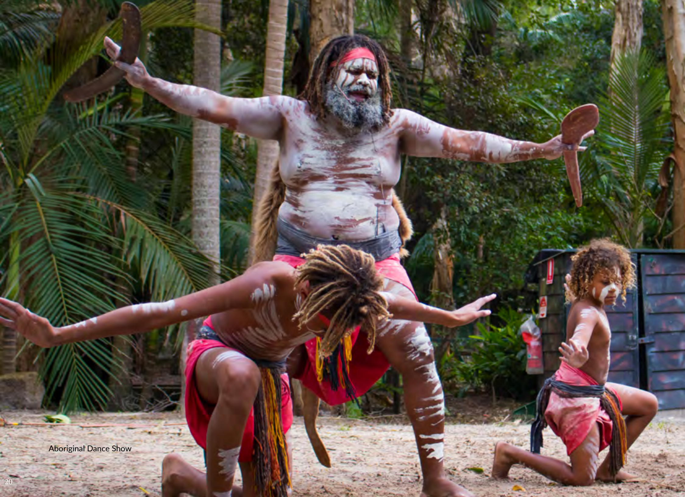
Aboriginal Dance Show